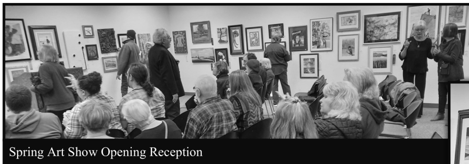
Spring Art Show Opening Reception

artists. Don’t miss this opportunity to find your next favorite treasure to bring home and take pride in knowing it was crafted by a local artist from our community. The Spring Art Show may be seen at the Museum during normal hours 10am-4pm, Tues-Sat, until April 13.